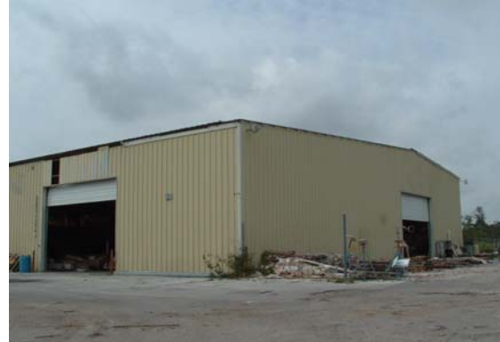
New location of JBW, still showing damage

Frances caused considerable damage in the Vero Beach area, but after the water subsided, Mark Johannsen was able to make building repairs and resume production in only a few short weeks. The bad news was yet to come however and come it did just three weeks later. Jeanne came through late on a Saturday night and again Vero beach was on the firing line being on the north side of the eyewall.